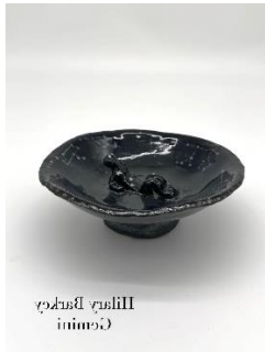
Hilary Barkey Ceramic