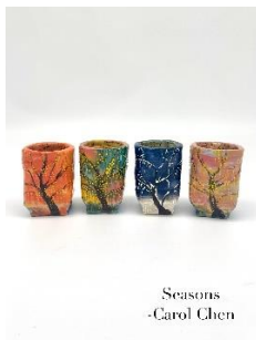
Seasons -Carol Chen