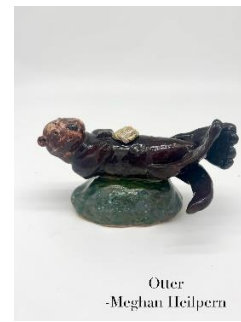
Otter -Meghan Heilpern