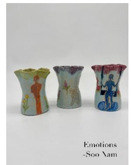
Emotions -Soo Nam