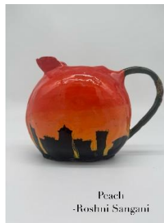
Peach -Roshni Sangani