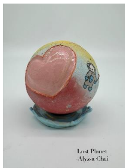
Lost Planet -Alyssa Chai